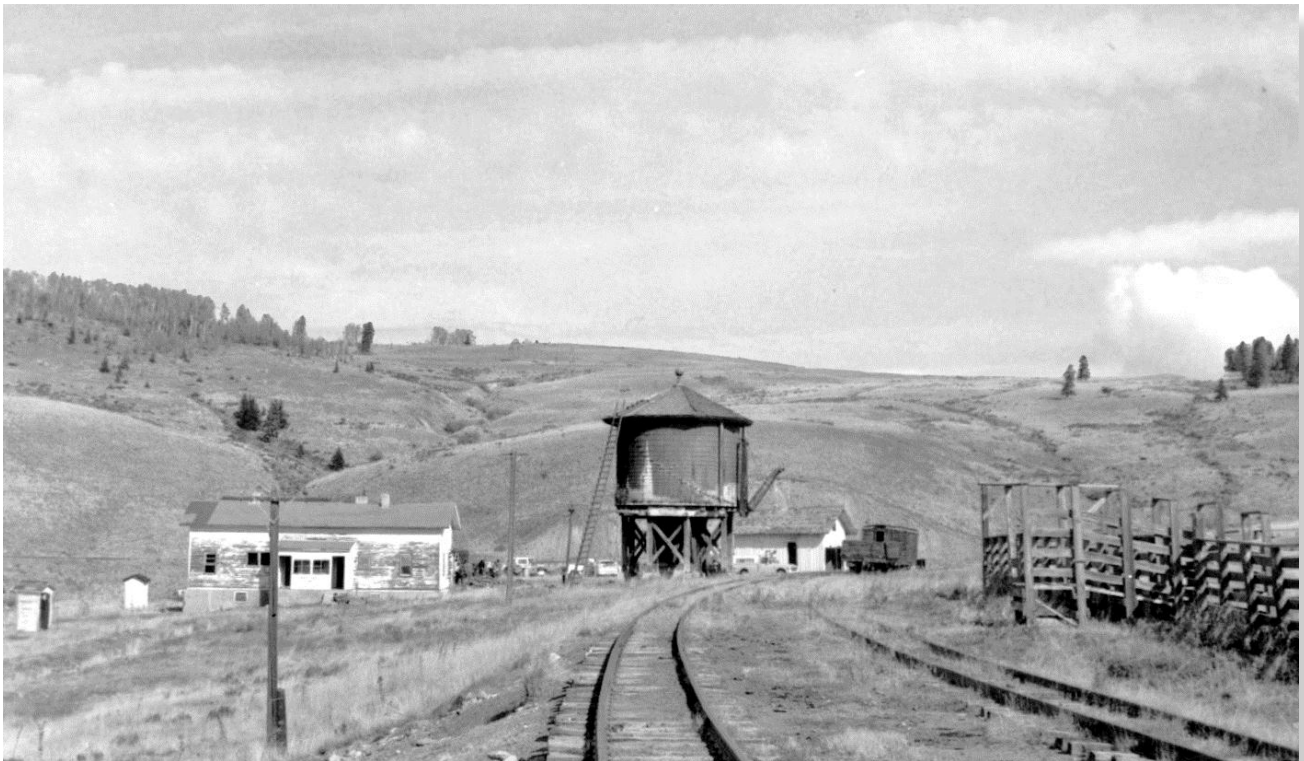
The Osier, CO section house and water tank in the fall of 1970 when the C&TS RR was launched. From the Friends of the C&TS RR, Inc. George Berkstresser Collection No. BRK 02-066