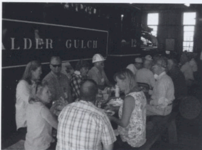
The kitchen gals spoiled us by setting up a lunch room in the engine house!