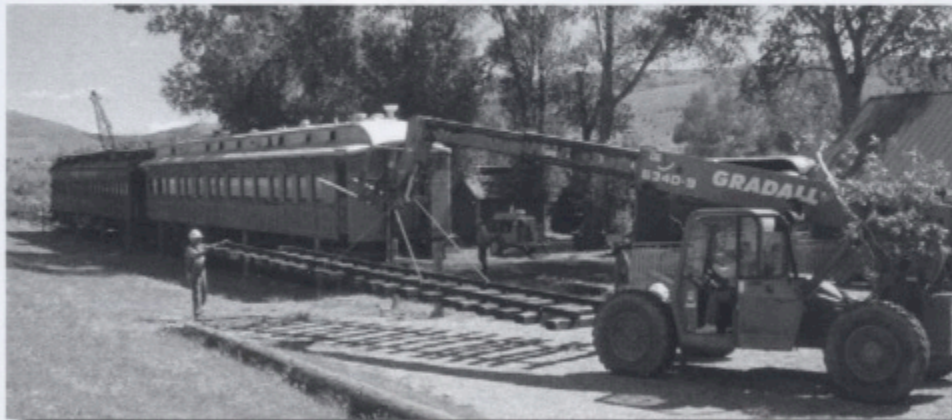
222 rests in its new location; Tarry Rahne guides removal of the last panel track.