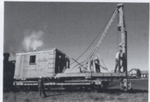
Pile Driver OB in operation as part of the TRAIN convention in October 2010.