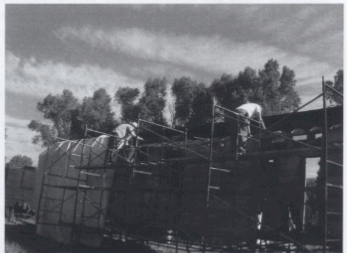
Bill Feldman, Don Bayer (TL) and Don Storm are preparing to install new roof boards.

Session C: Removed B-end corner posts. Removed rods that were cut for end door when made into work car; cut and installed new steel rods to support B-end; cut and installed plywood subfloor shim. Finished installing solid blocking on left side; installed bolts to tie door posts to car frame; removed bolts from B end sill and coupler support bars. Removed B-end sill; began removing bolts from A-end sill. Removed one door roller, door handle and right side postal door footstep from car 065 to replace missing items on 054.