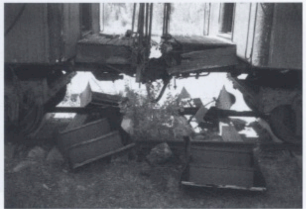
The vestibule steps removed by the Job 1150 team.

The Job 1150 team also removed the loose vestibule steps on the four-car string adjacent to the depot. The steps are stored in one of the cars for possible reattachment, and flashing was installed to prevent bird infiltration.