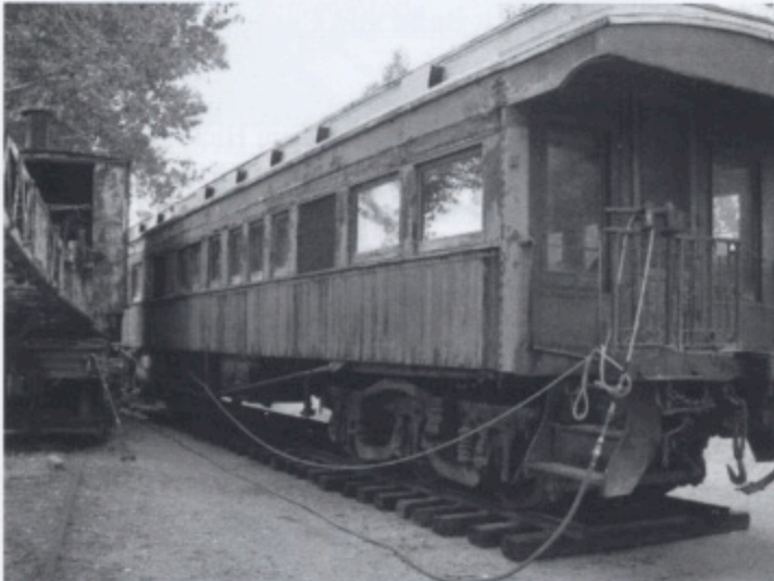
The orange hose is connected to an air compressor. The car's air brakes were used to stop its travel at the end of each move. Journal boxes received waste and lubrication prior to move.