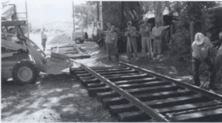
Art directs the curvature of the panel track.