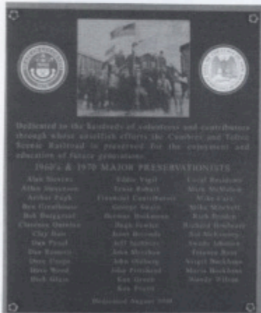
The commemorative plaque installed at the Antonito Depot on the Cumbres & Toltec Scenic Railroad. An identical plaque is displayed at the Chama Depot.