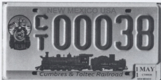
The Cumbres & Toltec license plate available from the New Mexico Motor Vehicle Division.