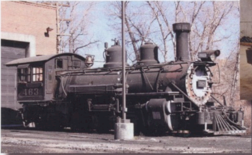
Locomotive 463 outside the Chama engine shop – October 25, 2008