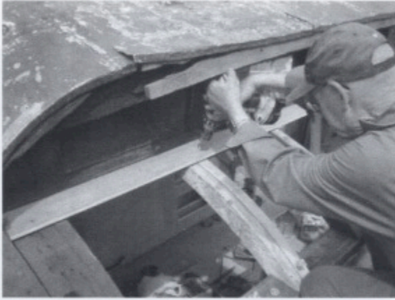
TL Don Bayer installs first piece of cedar tongue and groove.

Session E: Removed steel and rotted rafter from left-side roof; began cutting new left-side fir roof rafters .