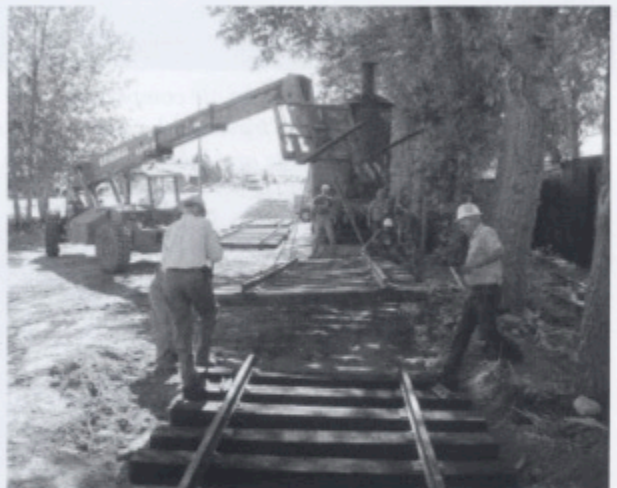
Positioning the second panel track. In front, Warren Ringer (back to camera) and Jim Hickman; and (l-to-r) Tarry Rahne, Art Randall and Don Juergenson. Note the two additional panels ready to go in the background.

The project entailed preparing a track extension from Great Northern Business Car A-3 northward, allowing Milwaukee car 222 to be moved from the engine house area to an area adjacent to A-3 near the depot.