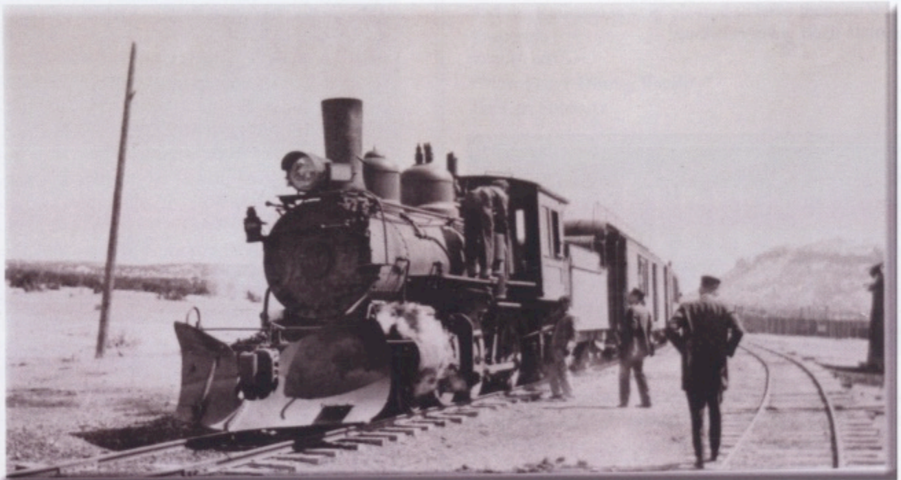
RD086-043 While its conductor waits impatiently, the Chili Line train waits while the air pump on T-12 engine number 167 receives attention somewhere in northern New Mexico.

Non-Profit Organization U.S. Postage PAID Albuquerque, NM Permit No.1710