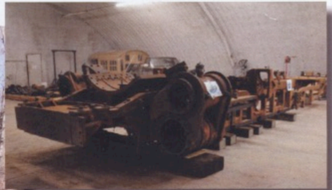
463's frame inside the Monte Vista, CO shop –February 16, 2011

It's a new year for the Friends of the Cumbres & Toltec Scenic Railroad, Inc. and we have not only a challenge, but an extremely unique opportunity in front of us.