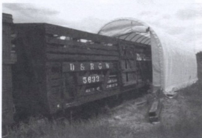
Stock Car #5633 being moved into the tent formerly occupied by Caboose 0503.