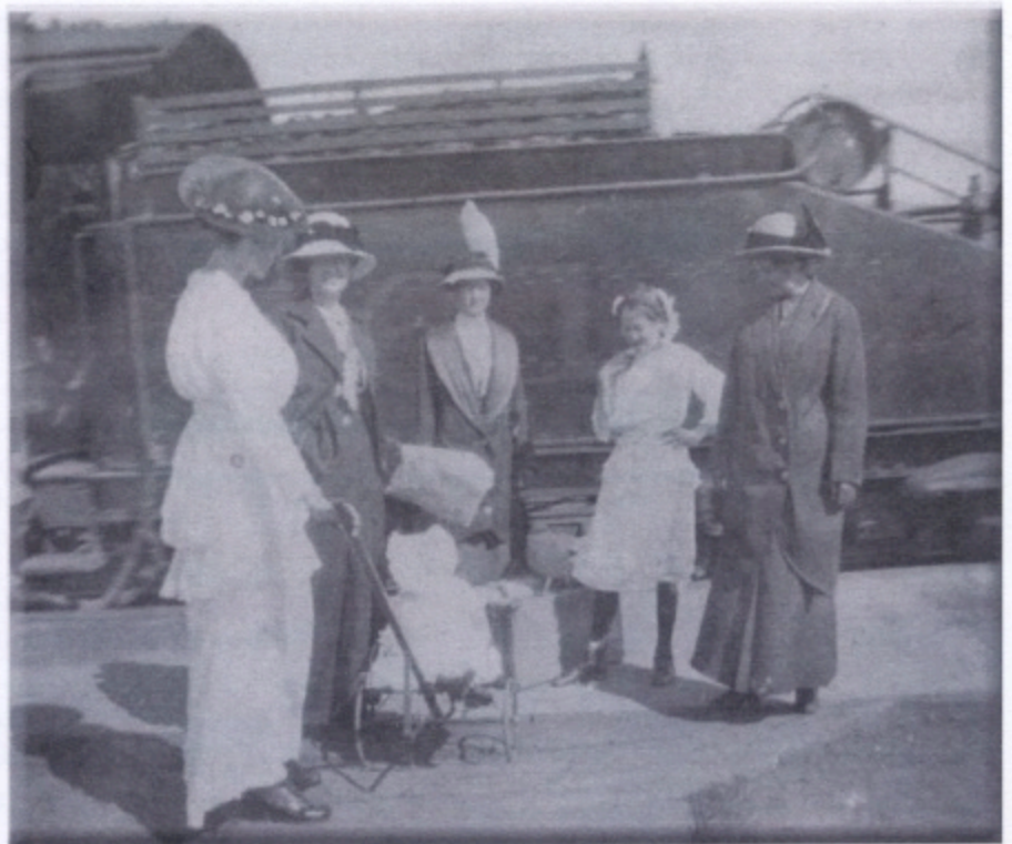
RD085-003 Family snapshots may contain much of interest, from the ladies in their Sunday best to the slope-back tender of K-27 locomotive 161, possibly at Antonito, Colorado.