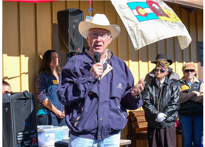
Former Interior Secretary Ken Salazar addresses the crowd