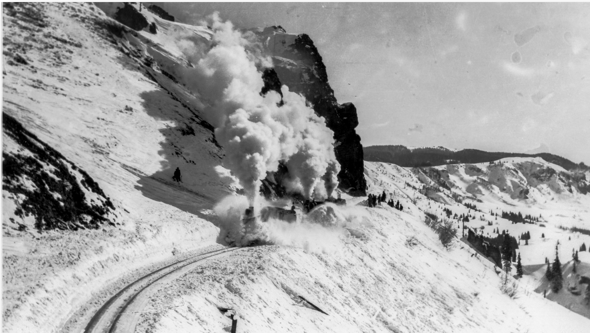
Bucking snow on windy point C1915. From the Richard Dorman collection RD064-124 (See page 2 for more information)