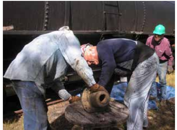
The Wheels & Brakes team in action!