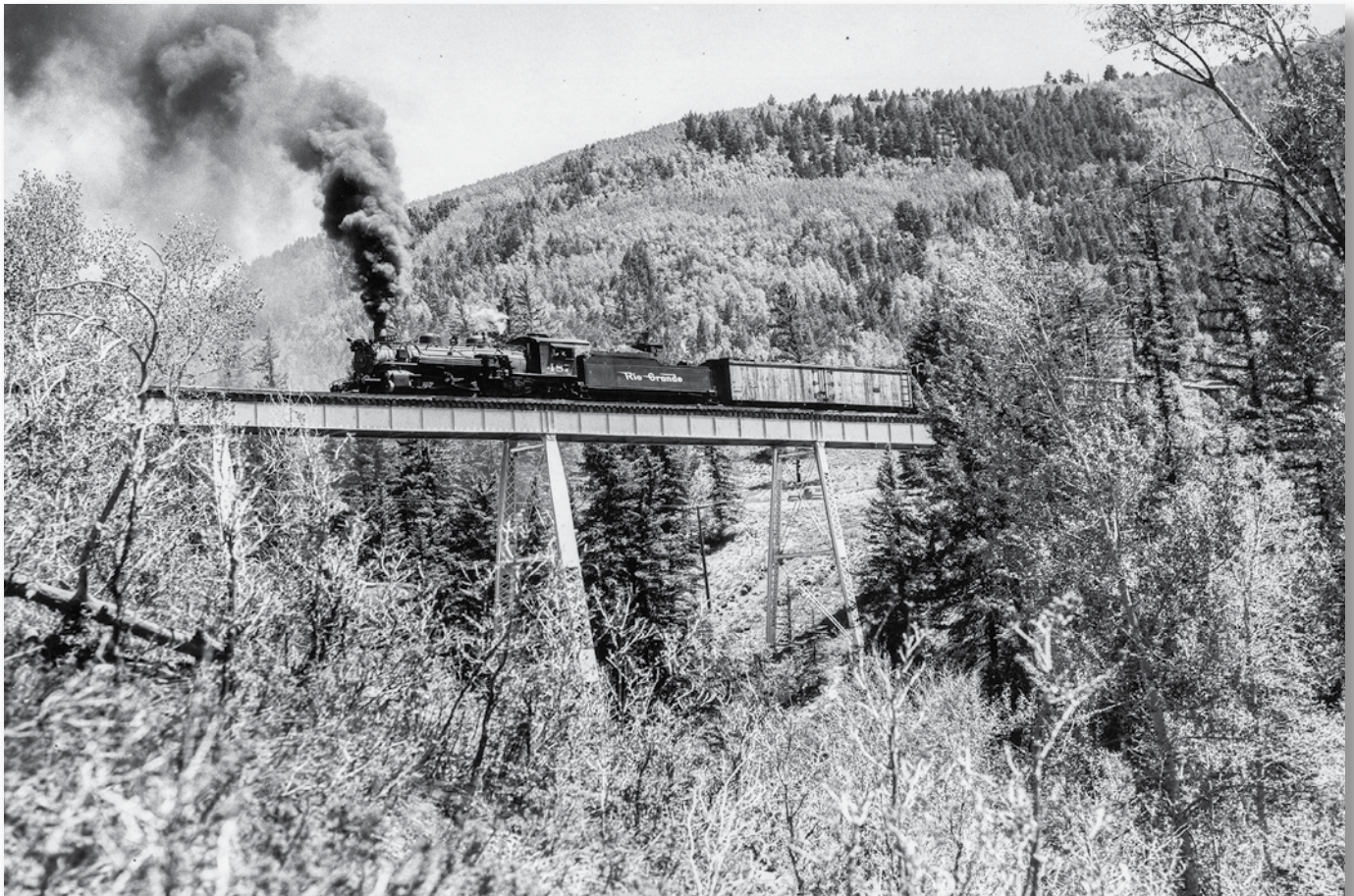
#487 with an eastbound freight crossing the Lobato Trestle in the summer of 1954